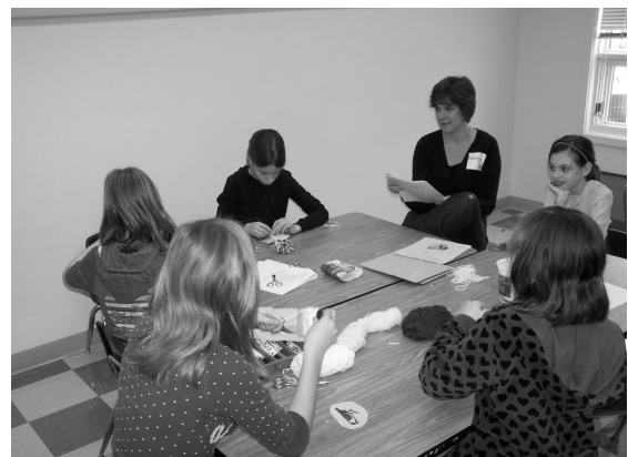
School's off, Church is on! – A great way for children to spend a day off school. Sign up for the Advent Event today!

Volunteers needed for lunch and program assistance. Contact Russell if you are interested or able to help.